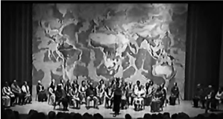
30 country representatives on the Goetheanum stage.